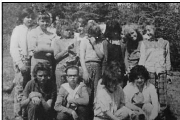
MYSTERY PHOTO: Recognize anyone? Let us know. This is most likely a photo from a rural school in this district.