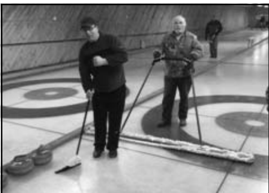
Hard working ice cleaners.