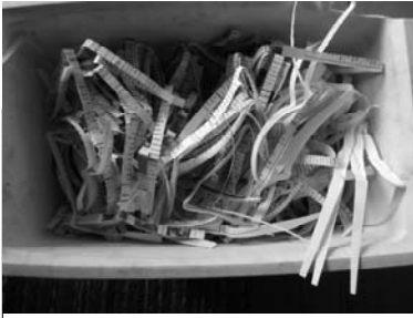
PHOTO ABOVE: We are shredding old issues of the Smeaton and District Newsletter. If there are any back copies you want, ask for them soon. There may be a mailing cost.