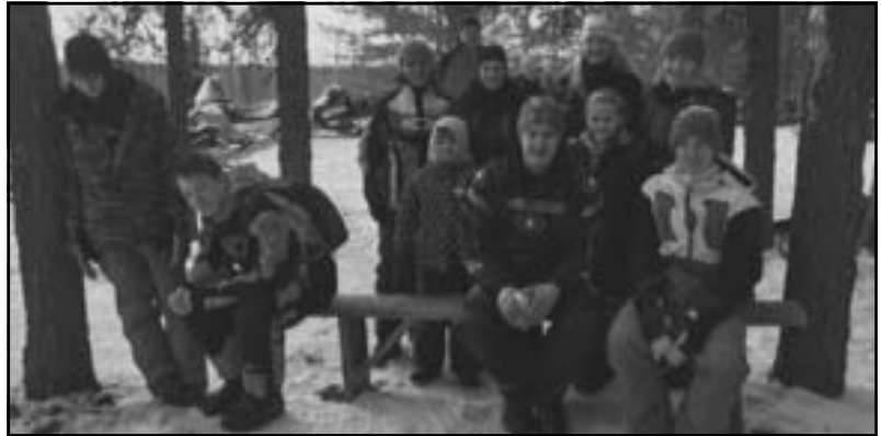
It was a perfect day out on the trails.