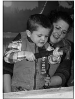
PHOTOS: Above left then counter clockwise: Women's smooch smooch; Crafts and Display by Sylvan Learning Centre; Children's Nail Driving; Swede Saw Competition, Men's and Women's.